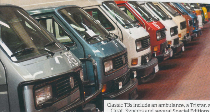
Classic T3s include an ambulance, a Tristar, a Carat, Syncros and several Special Editions.

To us, the VW bus is an icon of great value. It is the emotional heart of the Volkswagen Commercial vehicles brand and thus a heritage which needs to be preserved. And with each restoration we are preserving a piece of living history