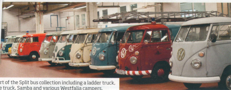
Part of the Split bus collection including a ladder truck, fire truck, Samba and various Westfalia campers.