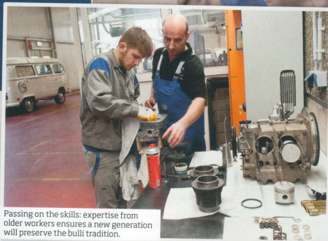
Passing on the skills: expertise from older workers ensures a new generation will preserve the bulli tradition.

And now, this expertise and skill is being made available to anyone who wants a full or part restoration on their own vehicle! Imagine – a full on VW Hannover Factory restoration, with original VW parts, carried out by trained VW mechanics and specialists, and coming with certificated ex-works documentation and warranty... plus a folder with full photographic and detailed description of all the work