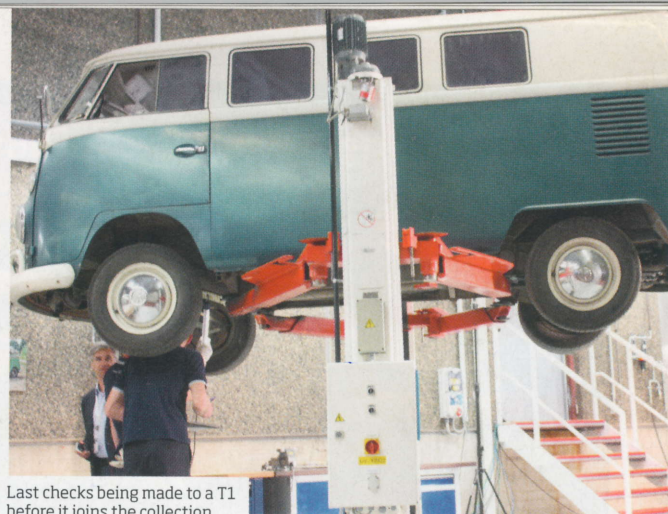
Last checks being made to a T1 before it joins the collection.